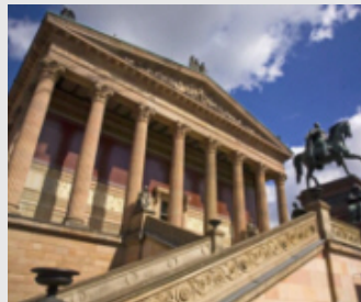
Museum Island in Berlin