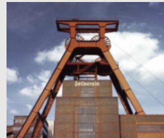
Zollverein Coal Mine in Essen