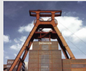
Zollverein Coal Mine in Essen