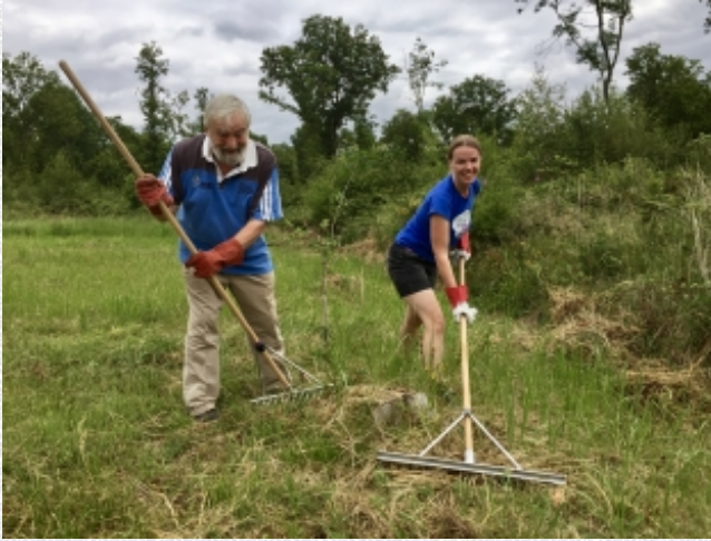
Volunteers at Finemere Wood by Charlotte Karmali