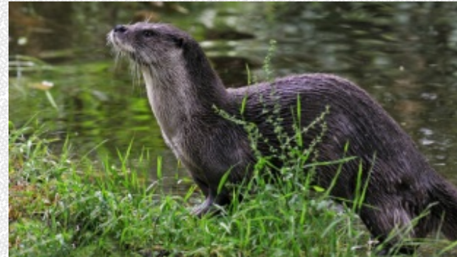
Otter by Rob Appleby

In the 1970s, otters were dangerously close to extinction in the UK. Thanks to hard work to clean up our rivers and restore their riverbank homes, otters can now be found in every single river in the UK, including the Thames. We want to see other species such as barn owls, water voles, hedgehogs and adders make these impressive comebacks.