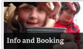
Info and Booking