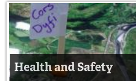
Health and Safety