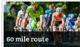
60 mile route