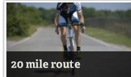
20 mile route