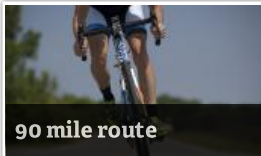
90 mile route