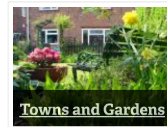
Towns and Gardens