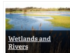
Wetlands and Rivers