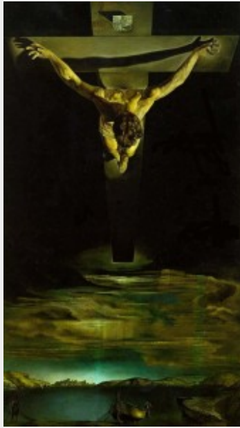
Salvador Dali's "Christ of St. John of the Cross"