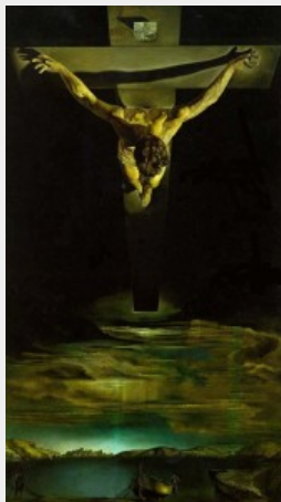
Salvador Dalí's "Christ of St. John of the Cross"