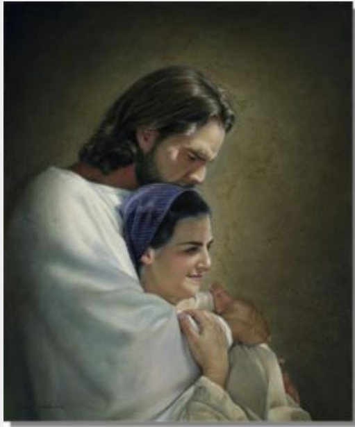
Jesus and Mary, his mother and ours

May 21. We pray to our Blessed Mother because she is an effective intercessor. Remember the Wedding at Cana? Jesus did not intend to begin his public ministry then, but because of his mother's urging, he changed his mind and worked his first miracle! Just as we ask our family and friends on earth to pray for us, we can ask our heavenly mother to intercede for us with her Son. He tends to listen to his mother.