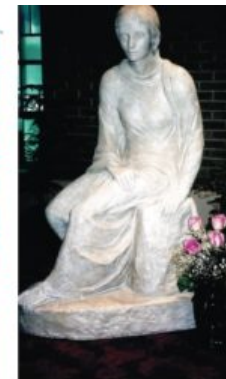
A Yearly Devotional