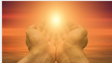
All our plans are in God's loving hands...

God of my life, give me the grace to alter my own personal plans when compassion or duty urges me to do so. And help me to realize that my entire life and all my plans are in your loving hands. Amen.