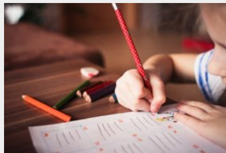
We learn Murphy's Law and some of its corollaries very early in life...