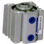
Ø 20-Ø 100 Short Stroke Cylinder