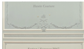
Ulyana Sergeenko's Spring Summer 2013 Couture Collection