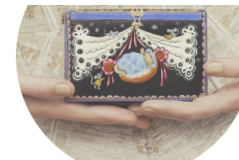
ULYANA SERGEENKO Couture S/S 2013 LOOKBOOK (Part II)