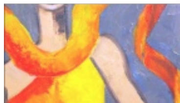
My Fashion Illustration: Butterfly In "INTERIORS"