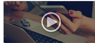
Corporate and Allied Laws