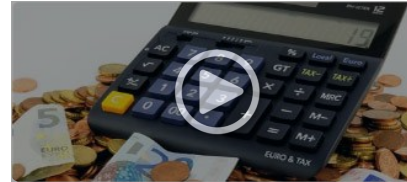
FR Fast Track