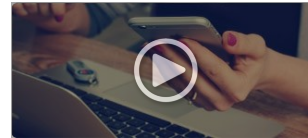
Corporate and Allied Laws