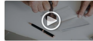
International Taxation-100 Marks Coverage