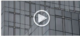
Strategic Financial Management