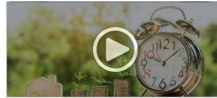
Direct Tax Laws and International Taxation