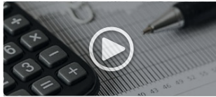
Corporate and Economic Laws (E)