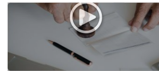
International Taxation-100 Marks Coverage