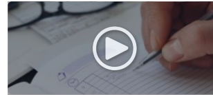
Corporate and Other Laws