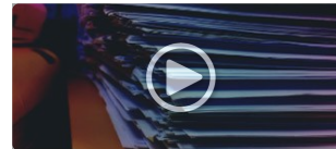
Cost & Management Accounting