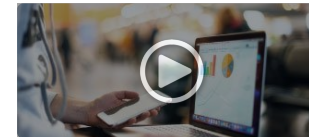
Industrial, Labour & General Laws