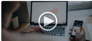
Tax Laws and Practice