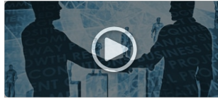
Setting up of Business Entities & Closure (Covered Part B & C, 60 Marks)