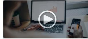
Tax Laws and Practice