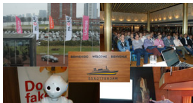
Call for Papers, APEX World