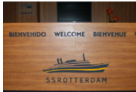
"APEX World 2018" 22 & 23 march 2018 on the SS Rotterdam