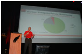
4 e APEX-dag: "APEX World 2013" 9 april 2013, Figi Zeist