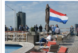
"APEX World 2017" 30 & 31 march 2017 on the SS Rotterdam