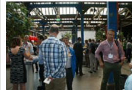
"Tech Experience 2017" 15 & 16 juni 2017 in de Rijtuigenloods