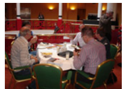
3 e DBA-dag: "DBA/SOA/BPM" 8 okt 2011, Figi Zeist