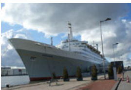
"APEX World 2016" 7 & 8 march 2016 on the SS Rotterdam