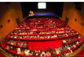
2 e APEX-dag: "APEX-dag 2011" 22 mrt 2011, Figi Zeist