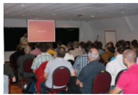
2 e DBA-dag: "11G in de praktijk" 14 sept 2010, Utrecht