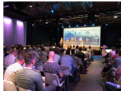
"Tech Experience 2018" 7 & 8 juni 2018 in de Rijtuigenloods