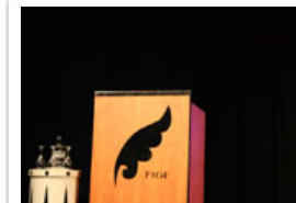
DBA & Middleware-dag: "Connecting the Clouds" 6 mei 2014, Figi Zeist