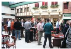
2 e Spatial-dag: "Spatial & IT aligned" 25 nov 2010, Utrecht