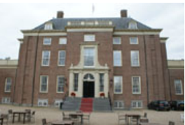
25 jaar OGH: "Jubileum Symposium" 18 sept 2012, Slot Zeist