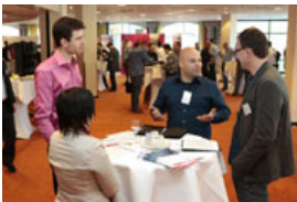
5 e APEX-dag: "APEX World 2014" 25 mrt 2014, Figi Zeist