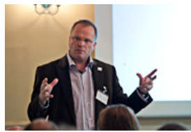
Middleware/SOA-dag: "Fusion Middleware/SOA" 19 mei 2010, Utrecht