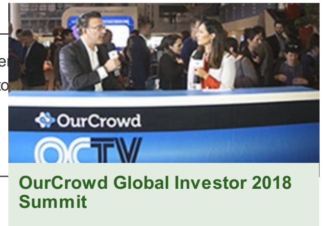
OurCrowd Global Investor 2018 Summit